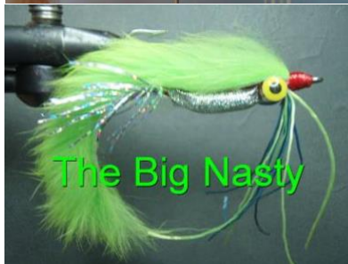
The Big Nasty