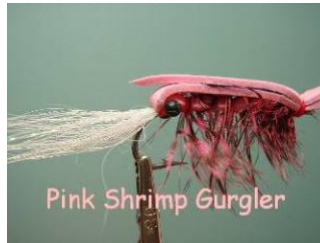
Pink Shrimp Gurgler