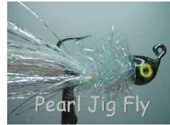
Pearl Jig Fly