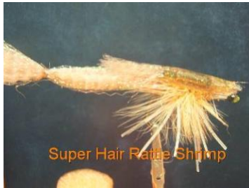
Super Hair Ratbe Shrimp