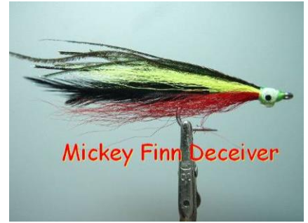
Mickey Finn Deceiver

Half and Half style - Half deceiver/half deep minnow. Tied olive over white bucktail, white feathers, with peacock herl back, heavy tungsten eyes, this is an awesome fly for deep water for almost every species: