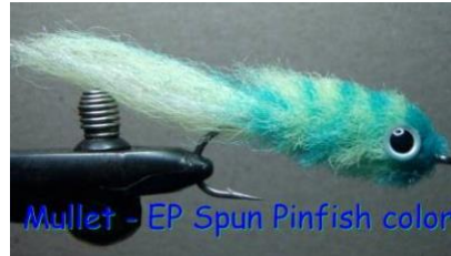
Mullet - EP Spun Pinfish color