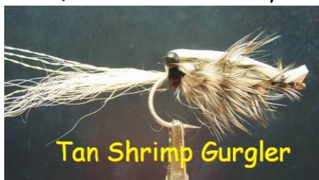
Tan Shrimp Gurgler

Shrimp Type: Encompassing a wide range of flies including but not limited to Shrimp Gurglers, weedless and weighted Graveline Shrimps, Mantis Shrimp, Super Shrimp, and Haystack (and other Borski style shrimp patterns):