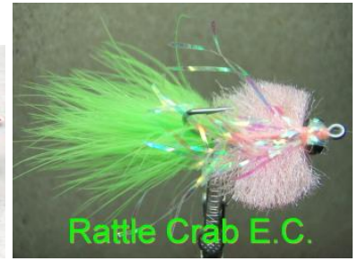
Rattle Crab E.C.