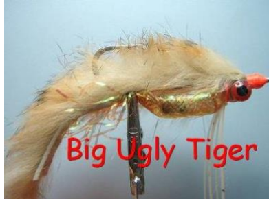
Big Ugly Tiger