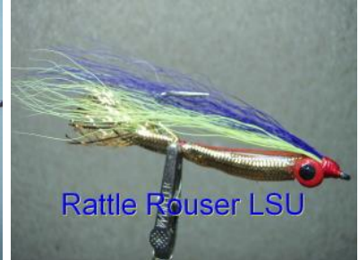
Rattle Rouser LSU