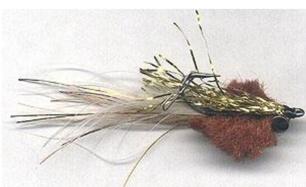
Richard's rattle Crab