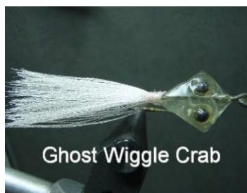
Ghost Wiggle Crab