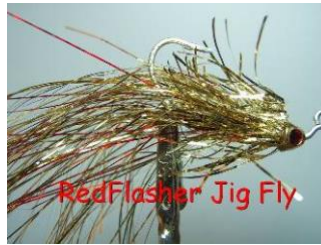
Red Flasher Jig Fly