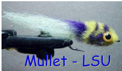
Mullet - LSU