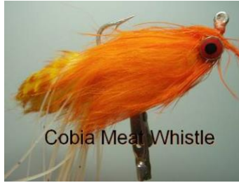
Cobia Meal Whistle