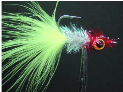
Pomp Fly w/Pearl