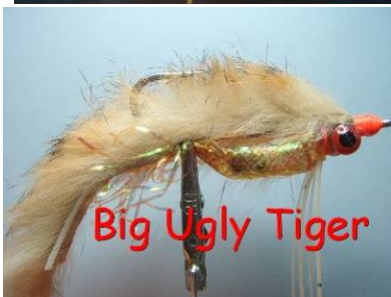
Big Ugly Tiger