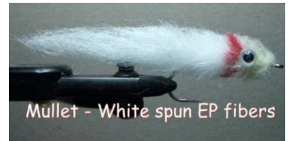
Mullet - White spun EP fibers