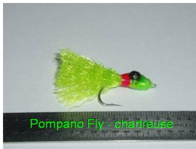
Pompano Fly - chartruse