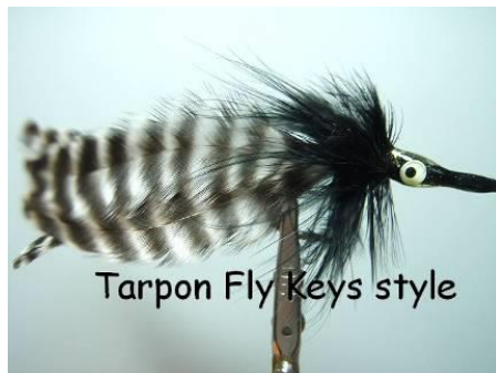
Tarpon Fly Keys style

Keys Style and other tarpon flies - with feathers or lepus & tarantula legs or marabou: