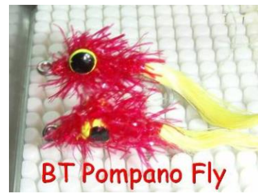
BT Pompano Fly