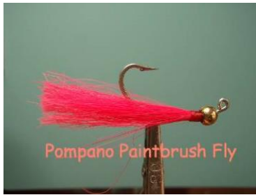
Pompano Paintbrush Fly