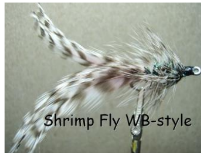
Shrimp Fly WB-style

Bendback styles - Tied to be weedless, this particular type is tied with the material extending up over the hook point making this fly semi-weedless with the hook point riding up. The hook may be bent back but in these patterns it is not.