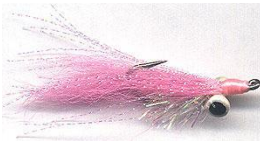
Pink Cactus Charlie

Pink Cactus Charlie pattern - my variation of the Red Stick Fly-Fishers classic Pink Thing is tied with light/pale pink calf tail using coral pink Danville flat waxed nylon thread with a veil of pearl Krystal flash. Hundreds of Specks and Reds have been caught using this little fly as well as Bonefish. Use pearl Dan Bailey's Long Flash Chenille for the body: