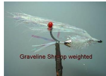
Graveline Shrimp weighted