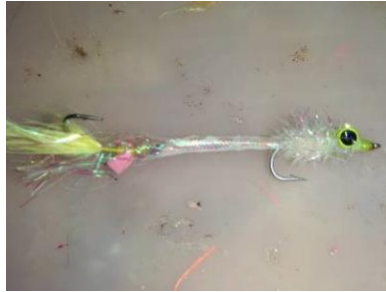
Polychaete extended body with floating foam tail

Minnow style - Epoxied super hair with silver Mylar representing the lateral line and with a touch of rust or red in the belly to imitate the little anchovies and silversides locally and seasonally known as Red Minnows. Little Tunny, Spanish Mackerel and Reds gorge on them when they school, also made with DNA fibers and all fluorofibre. Newer styles proven exceptional incorporate plastic lips and another, PolarFibre enveloping FisHair: