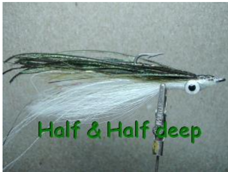
Half & Half deep

Half and Half style - Half deceiver/half deep minnow. Tied olive over white bucktail, white feathers, with peacock herl back, heavy tungsten eyes, this is an awesome fly for deep water for almost every species: