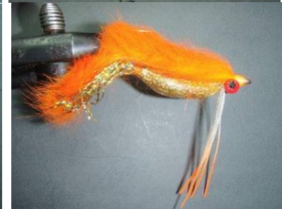
The Big Ugly Orange

Double Lepus (double bunny) style- In orange and ginger or yellow/red stripes this is the