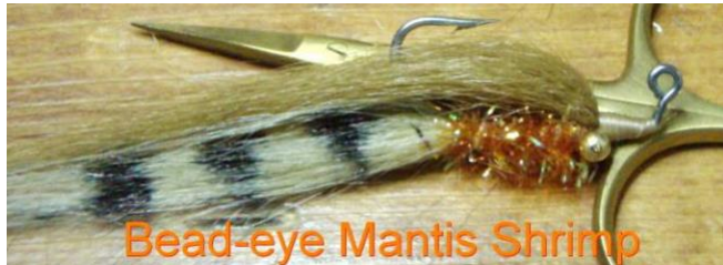
Bead-eye Mantis Shrimp