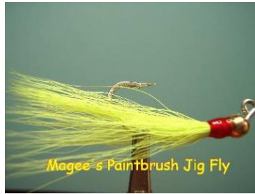
Magee's Paintbrush Jig Fly