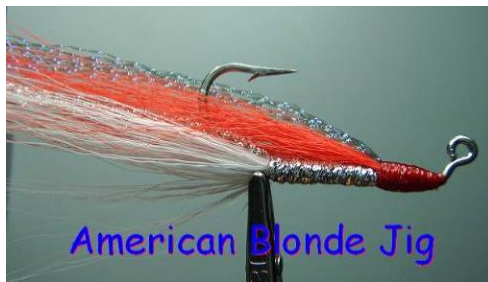
American Blonde Jig

Brooks' Blondes style - Easily tied and still a very effective bucktail fly especially in white or red & white on a jig hook (American blonde) or the Platinum for all species: