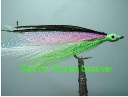
Electric Chicken Deceiver