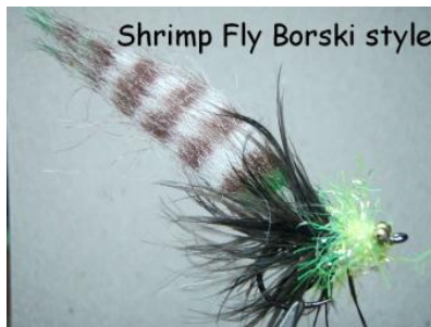
Shrimp Fly Borski style