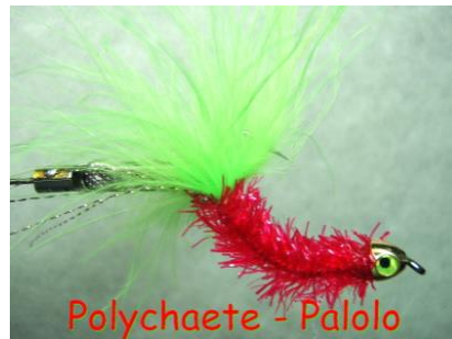
Polychaete - Palolo