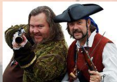
Creators of Talk Like a Pirate Day, Ref. Wikipedia

What is a pirates favorite letter? You’d think it’d be Rrrr, but they love the C!